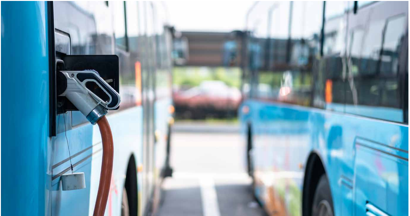
The PSLebus software solution integrates all e-mobility tasks into one system.

operations are to be sustainable—but still no less reliable—new factors such as limited battery range, charging infrastructure on bus routes and in the depot, numbers of passengers, outside temperature and connection capacity will be decisive.